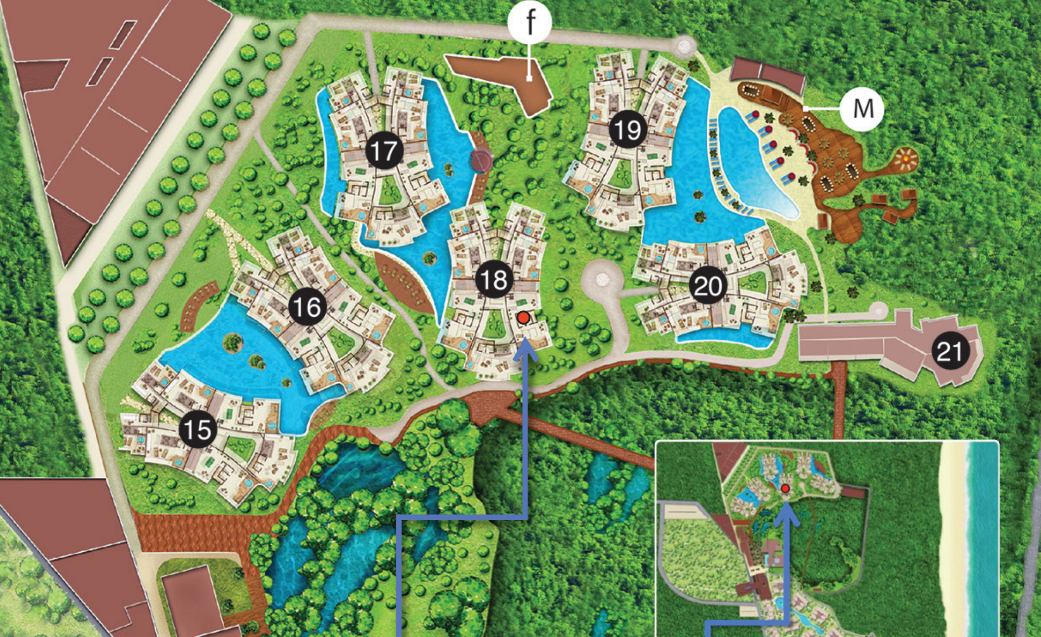
RESIDENCIA / RESIDENCE 1833