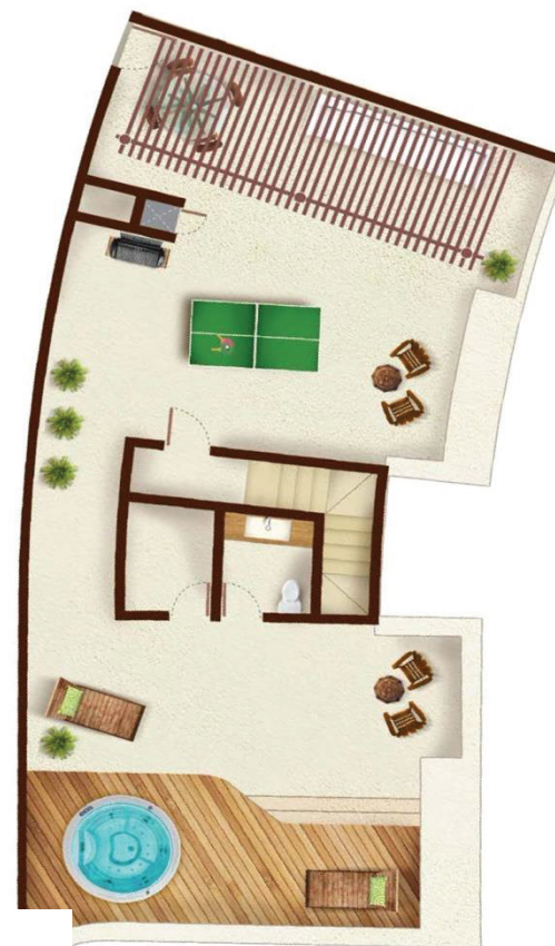
PENTHOUSE & SOLARIUM