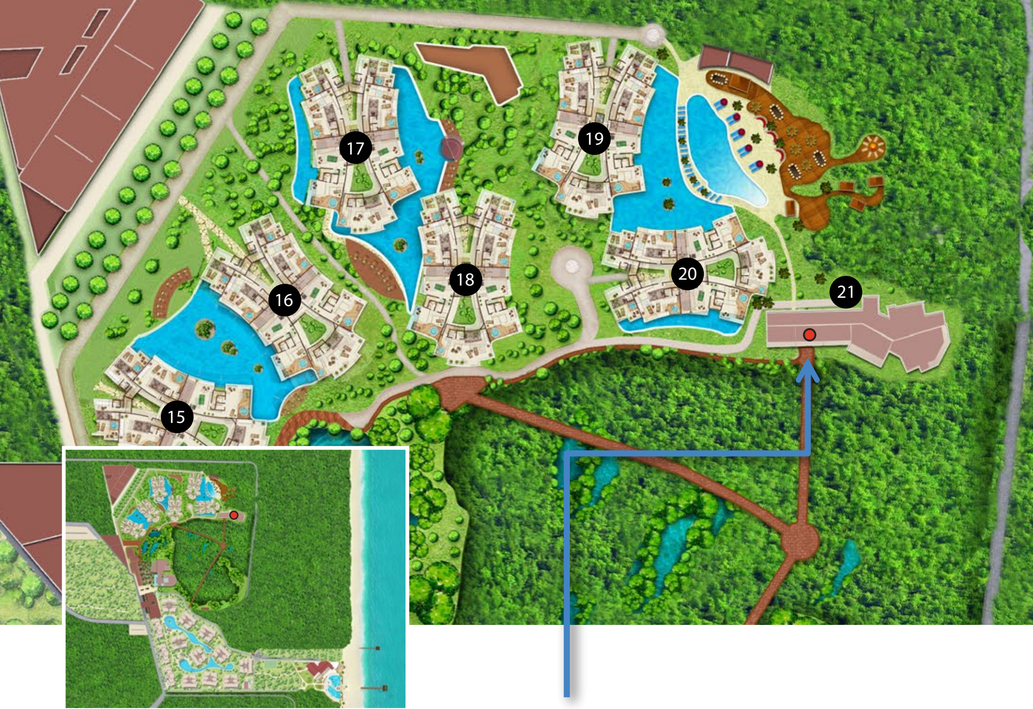
RESIDENCIA | RESIDENCE 2112